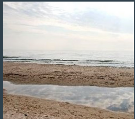
PIER COVE BEACH

This secluded, peaceful strip of sand, water, and views is for anyone open to the challenge of climbing 350 stairs up and down to the beach. 14 min drive