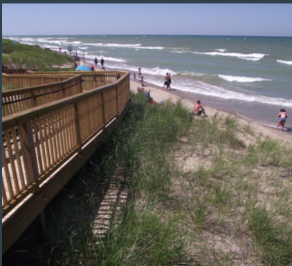
WEST SIDE COUNTY PARK

Get back to nature in this state-owned park, featuring 2.5 miles of secluded beach and 200-ft wooded dunes. 11 min drive