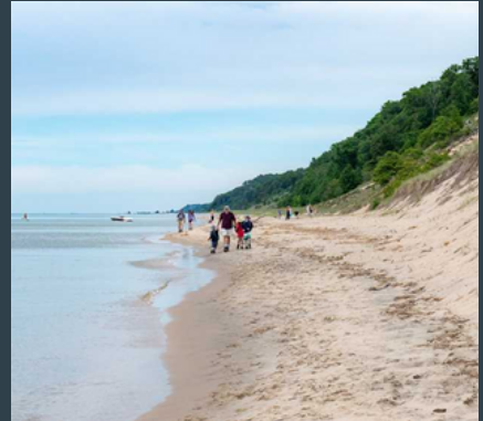
SAUGATUCK DUNES STATE PARK

A quiet, cozy neighborhood beach that's inlaid with trees along the waterline. 15 min walk or 3 min drive